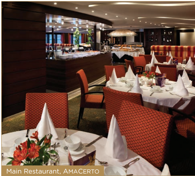
Main Restaurant, AMACERTO

Experience the Danube, Rhine or Moselle rivers aboard AmaWaterways' spectacular twin balcony ships! A walking track, heated swimming pool and fleet of bikes allow you to trek, float or glide alongside majestic hills, castles and town squares. And elegantly appointed staterooms envelop you in comfort so you can recharge for another captivating day of European discovery.