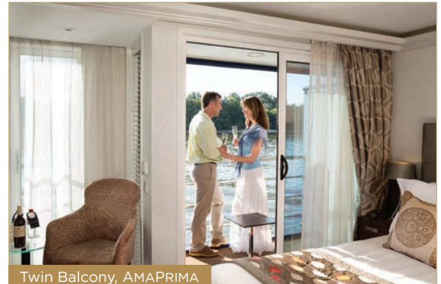
Twin Balcony, AMAPRIMA