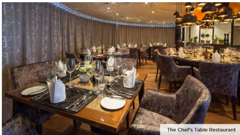
The Chef's Table Restaurant